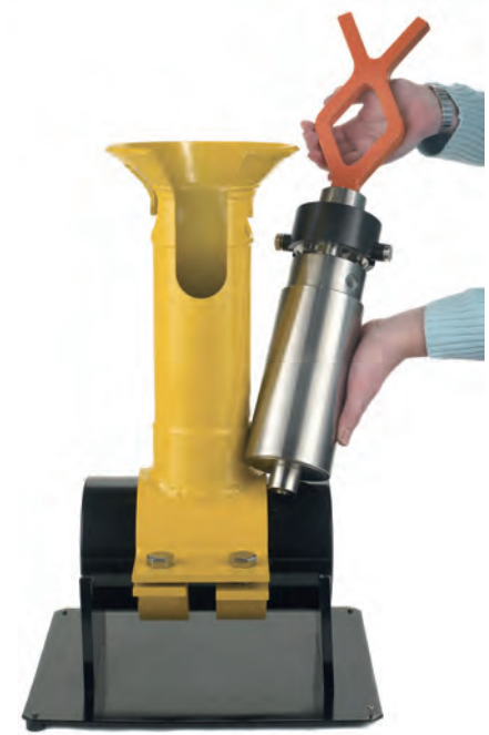
Subsea version og the ClampOn DSP Leak Monitor.

The basic theory is that a leak creates a very high-frequency noise that can be monitored by an ultrasonic sensor. In a «non-leak» situation the ultrasonic pattern will be stable, but when a leak occurs the signature will change drastically. The ClampOn DSP Leak Monitor is based on the ClampOn Ultrasonic Intelligent Sensor technology platform. The instruments ability to monitor signal at multiple frequency, combined with extreme sensitivity enables it to distin-