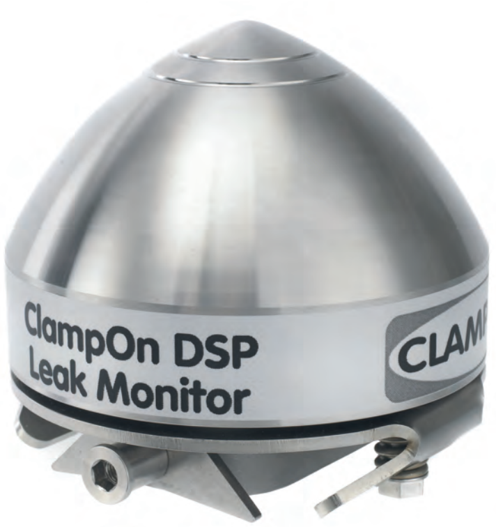
ClampOn DSP Leak Monitor Ex ia version.