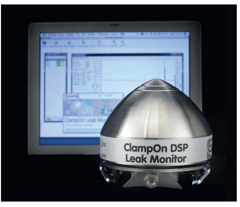
Data from the sensor can be displayed on PC or interfaced with control system.