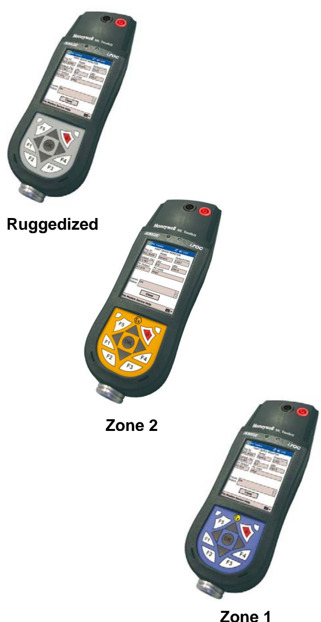
Figure 1 MCT202 Selectable versions (Ruggedized, Zone 2 and Zone 1 Intrinsically safe