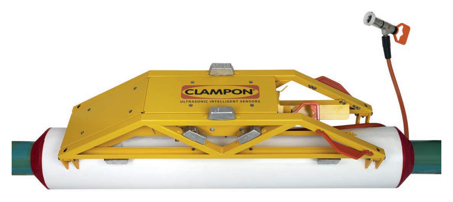
Spool piece with pre-installed ClampOn CEM® with ROV-installable/retrievable electronics.