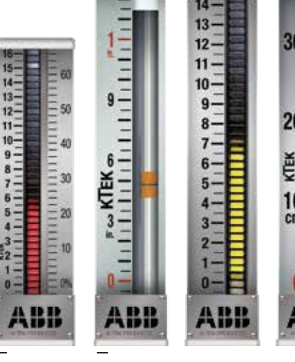
Dual bar graph indicator