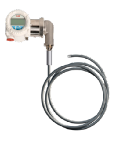
LMT100 Direct insertion magnetostrictive liquid level transmitter with removable flexible sensor