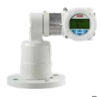
LLT100 Laser level transmitter