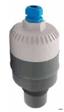
LST100 Ultrasonic level transmitter