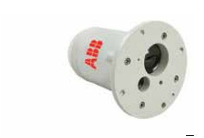
LM80 Laser level transmitter