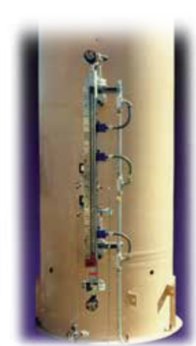
New level measurement standard with K-TEK products