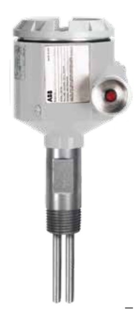
TX thermal dispersion switch