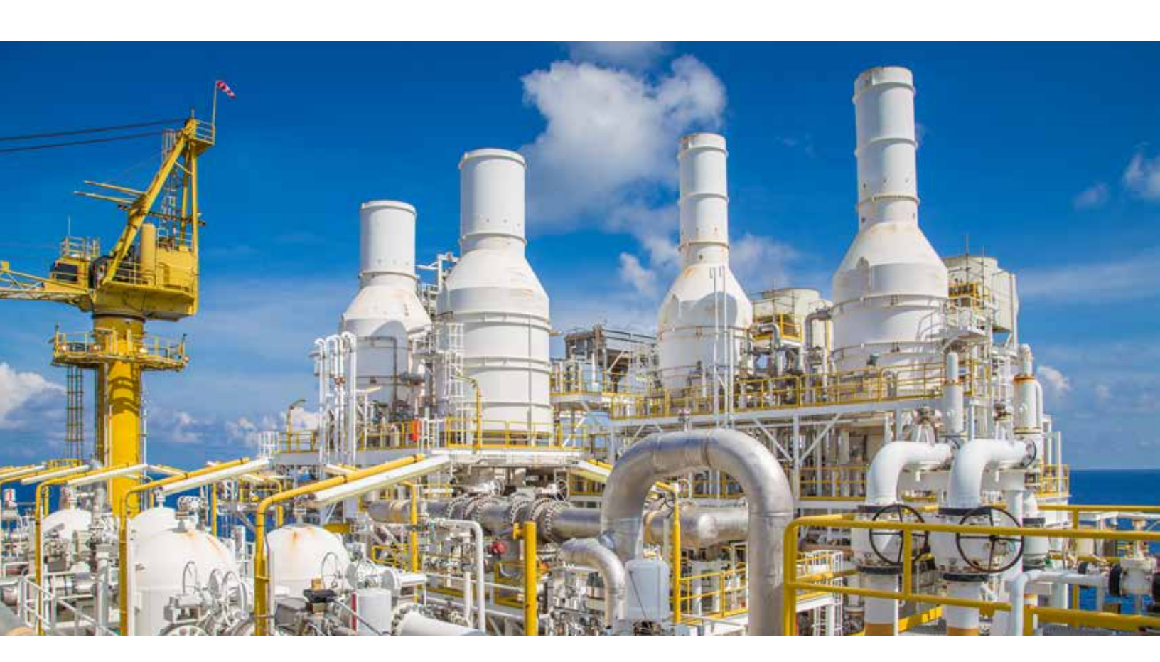
ABB provides the only magnetostrictive level transmitters in the world to be certified for use in IEC 61508 SIL2 and SIL3 rated control loops.

With over 200,000 magnetostrictive transmitter installations worldwide, the LMT Series Magnetostrictive Level Transmitter continues to provide the highest accuracy and repeatability for liquid level applications in the oil and gas, power generation, chemical, food and beverage industries and many more. These transmitters are used extensively around the world to provide continuous level indication, and transmission of an analog and/or digital signal for monitoring or control. The Magnetostrictive Level Transmitter versatility allows direct in-tank installation or externally mounted to a magnetic level gauge. 4-20 mA HART and FOUNDATION Fieldbus protocol options make the magnetostrictive level transmitters compatible with most control systems.