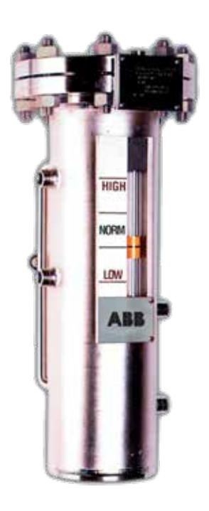
ST95 Seal fluid supply tank for barrier fluid systems