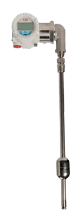
LMT100 Direct insertion magnetostrictive liquid level transmitter