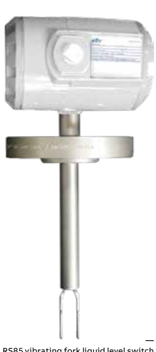
RS85 vibrating fork liquid level switch