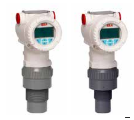
LST300 Ultrasonic level transmitter