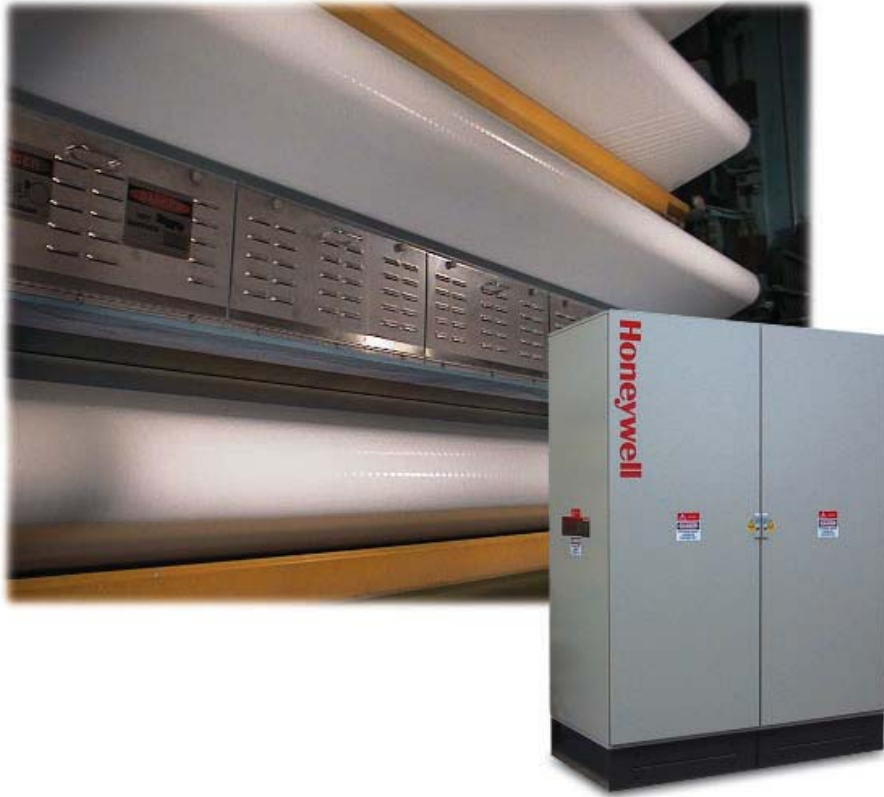
Calcoil Model 9710-S with off-machine power module cabinet